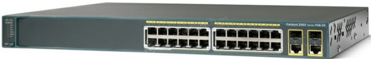
Table 1 shows the Quick Spec of the WS-C2960-24PC-L.

Figure 1 shows the appearance of the WS-C2960-24PC-L.