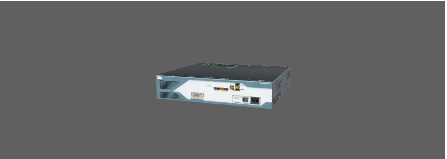
Figure 1. Cisco 2800 Series

Cisco Systems ® , Inc. is redefining best-in-class enterprise and small- to- midsize business routing with a new line of integrated services routers that are optimized for the secure, wire-speed delivery of concurrent data, voice, video, and wireless services. Founded on 20 years of leadership and innovation, the Cisco ® 2800 Series of integrated services routers (refer to Figure 1) intelligently embed data, security, voice, and wireless services into a single, resilient system for fast, scalable delivery of mission-critical business applications. The unique integrated systems architecture of the Cisco 2800 Series delivers maximum business agility and investment protection.